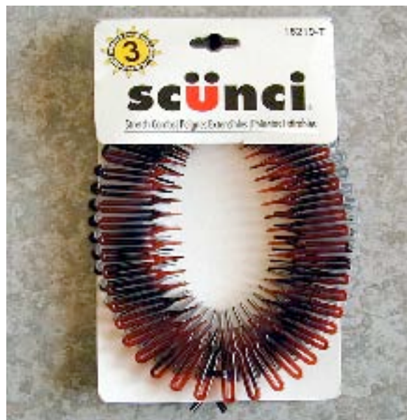
Illustration 3 Stretchable plastic hair combs

If there is no garter bar available for your machine or if it is expensive to buy, making your own with inexpensive supplies is, as Martha would say, “A good thing”. The best part is that you can make the garter bar to exactly fit your bulky or midgauge needlebed regardless of the needlebed gauge. You will need your machine and the following items: stretchable plastic hair combs as shown in Illustration 3, an unpainted yardstick, some spring clips, a glue gun or wood glue, and some newspaper to protect the floor under your machine. The hair combs are very inexpensive and can be found at most drug or grocery stores or you might find more economically ones at a craft store. The yardstick can be found at hardware stores or you might even be able to find one at home.