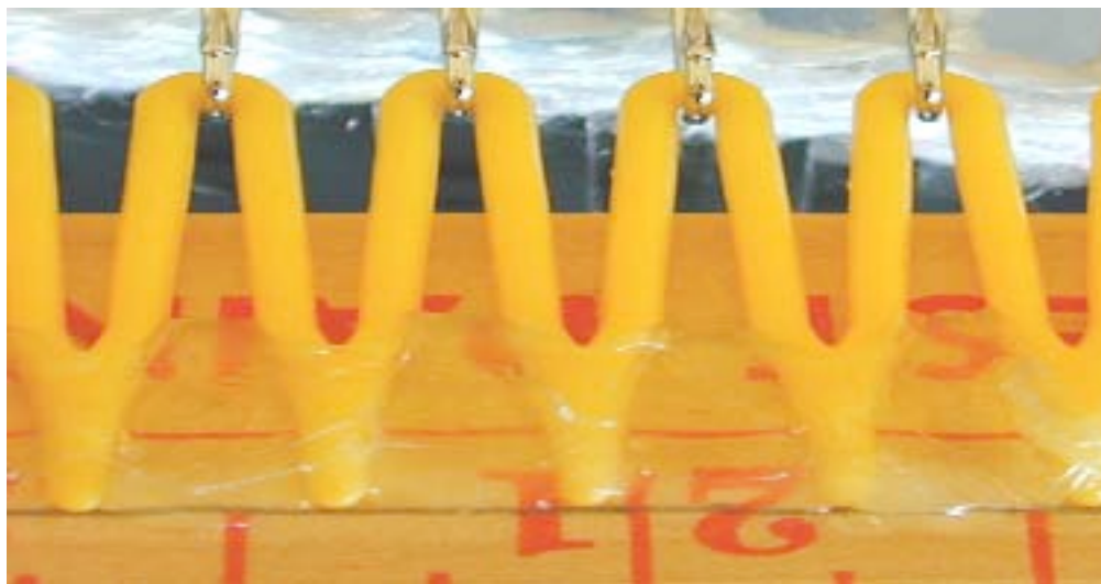
Illustration 5 Apply glue to comb teeth

You can make a whole family of garter bars for different uses for all your machines and you can add as many combs across the yardstick as you wish. Don't worry too much about an uneven loop where the combs come together. Label your garter bars with which machine they are for and how many loops they have for easy reference.