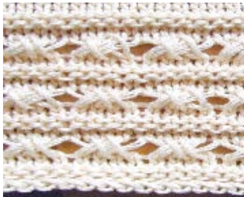
Illustration 1 Purl Ridges

My favorite use of a garter bar is to knit what I call "purl ridges" . By turning the work around from one side to the other, knitting one or two rows, and then turning it back, you get a row of raised purl stitches on the otherwise flat stockinette stitch side which adds texture to the surface of what you are knitting. Illustration 1 shows purl ridges between crossed stitches. Illustration 2 shows a purl ridge in a contrasting color for more punch.